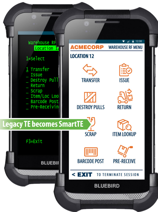
StayLinked SmartTE takes traditional terminal emulation to new heights with touch screen capabilities and rich graphics.

By introducing new intelligence to the terminal emulation process on the host system, the emulation screens can be intercepted before they are sent to the wireless device, and the elements of the green screen can be overwritten by a rich graphic interface that is familiar and easy-to-use to the mobile user.