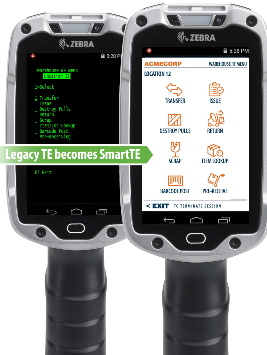
StayLinked SmartTE takes traditional terminal emulation to new heights with touch screen capabilities and rich graphics.

By introducing new intelligence to the terminal emulation process on the host system, the emulation screens can be intercepted before they are sent to the wireless device, and the elements of the green screen can be overwritten by a rich graphic interface that is familiar and easy-to-use to the mobile user.