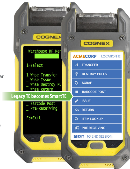
StayLinked SmartTE takes traditional terminal emulation to new heights with touch screen capabilities and rich graphics.

By introducing new intelligence to the terminal emulation process on the host system, the emulation screens can be intercepted before they are sent to the wireless device, and the elements of the green screen can be overwritten by a rich graphic interface that is familiar and easy-to-use to the mobile user.